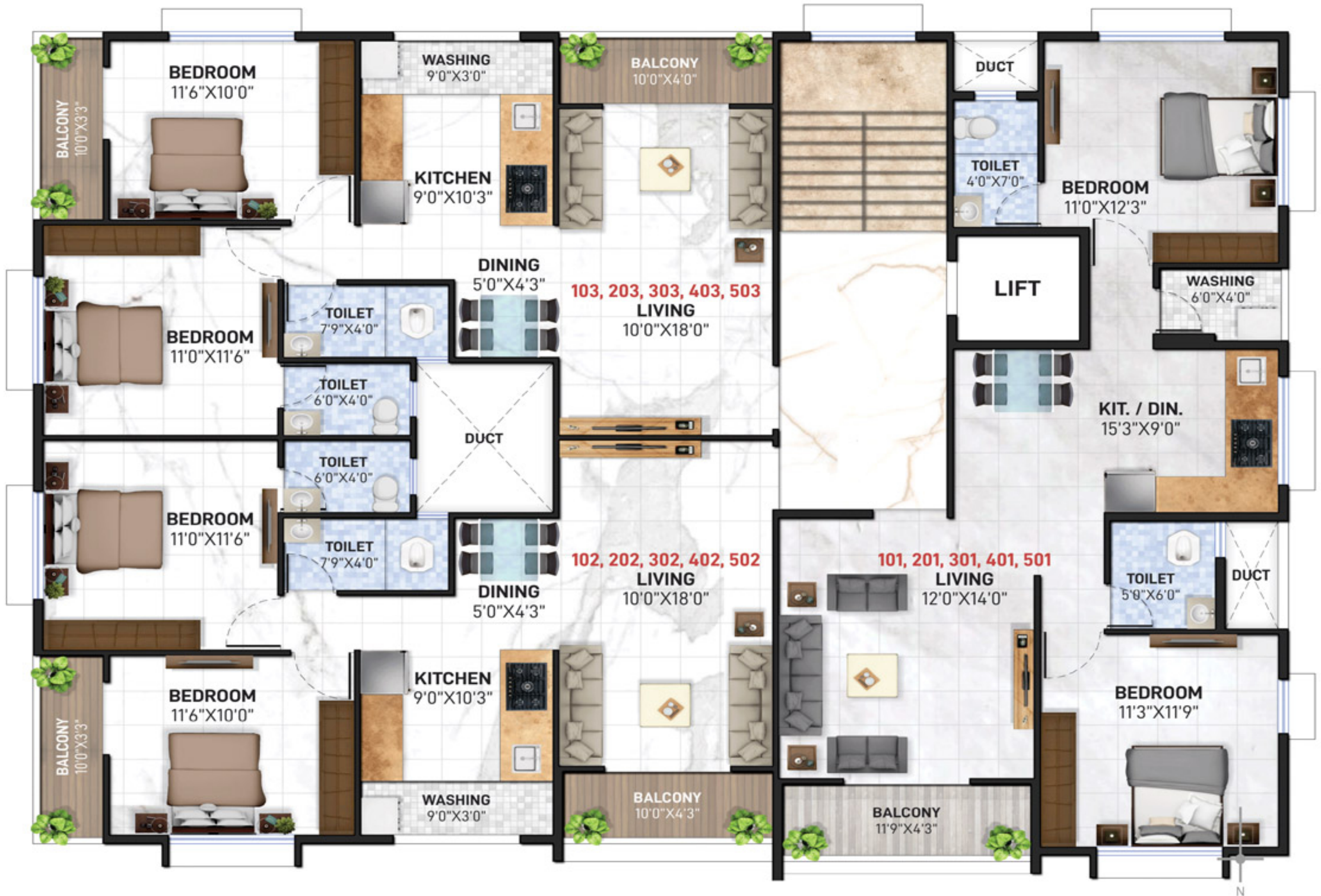
RESIDENTIAL - TYPICAL 1st to 5th FLOOR PLAN